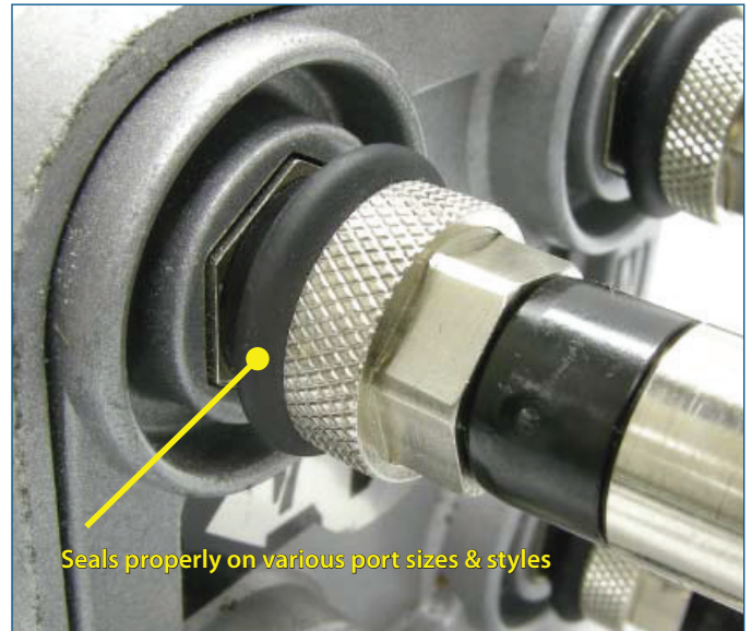
AquaTight® EX® Universal compression connectors ensure proper port sealing every time