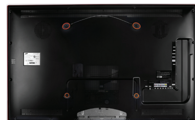
Shown on back of flat panel