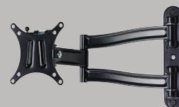
Full Motion Mounts